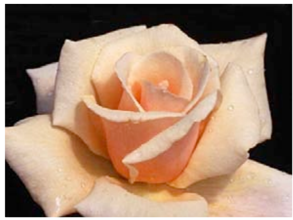
Buck Rose - Serendipity

If you enjoy roses and are looking for an easier alternative these may be just right for you!