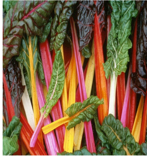
Bright Lights Swiss Chard

BONUS: In the Spring you may find caterpillars eating on some of your beautiful herbs - particularly parsleys, fennel, dill and rue. These will shortly reveal their true identities...Swallowtail Butterflies!